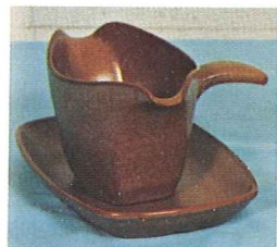
6S—TWO-SPOUT GRAVY 6.50 5PS—9" PLATTER-TRAY 3.75 6S/ST—TWO-SPOUT GRAVY/W TRAY 10.00