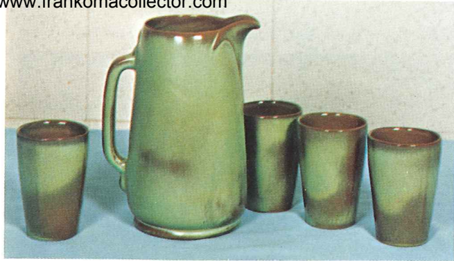
9.25 80—2 QT. PITCHER 5L—12 OZ. TUMBLER 3.75