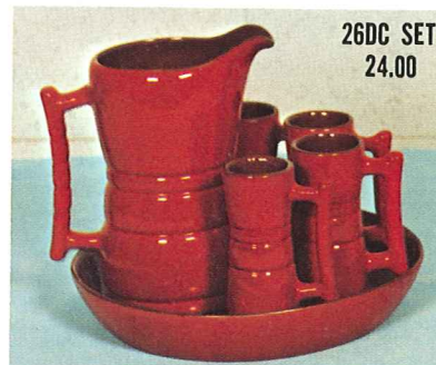
26DC SET 24.00