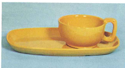
SOUP AND SANDWICH SET 4SC—11 OZ. SOUP CUP 3.75 6P—11" PLATTER-TRAY 4.50