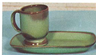
COFFEE AND DESSERT SET 3.75 5PS—9" PLATTER-TRAY C2—10 OZ. MUG 3.25 (or choose your own style Mug — See Pg. 9)