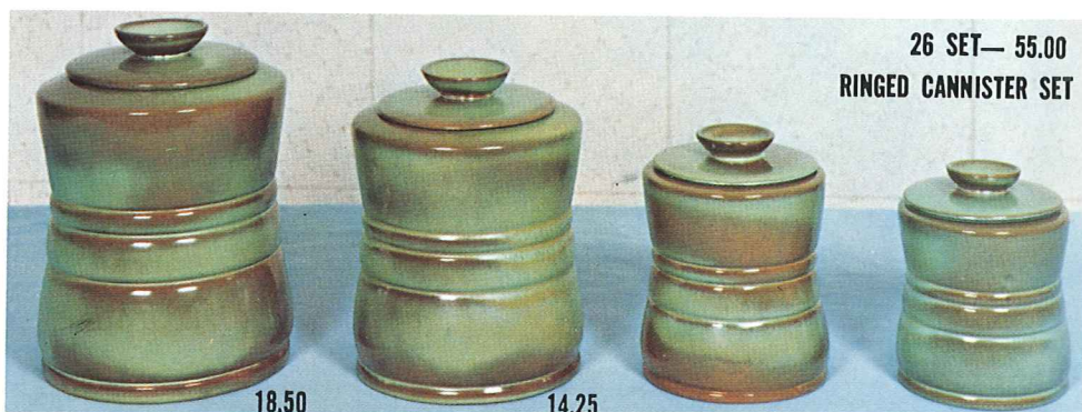
26 SET— 55.00 RINGED CANNISTER SET