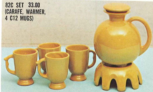
82C SET 33.00 (CARAFE, WARMER, 4 C12 MUGS)