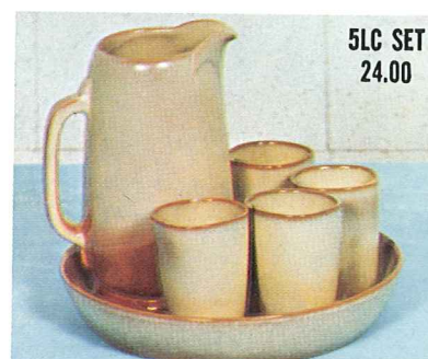
5LC SET 24.00