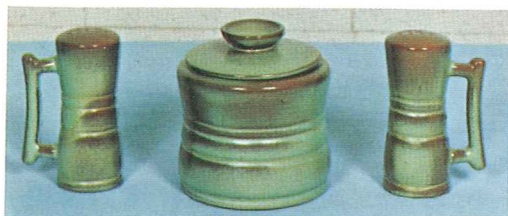
26G—SUGAR/GREASE 26H—SALT & PEPPER 9.25 26GH—4-PIECE SET/BOXED 6.00 15.00